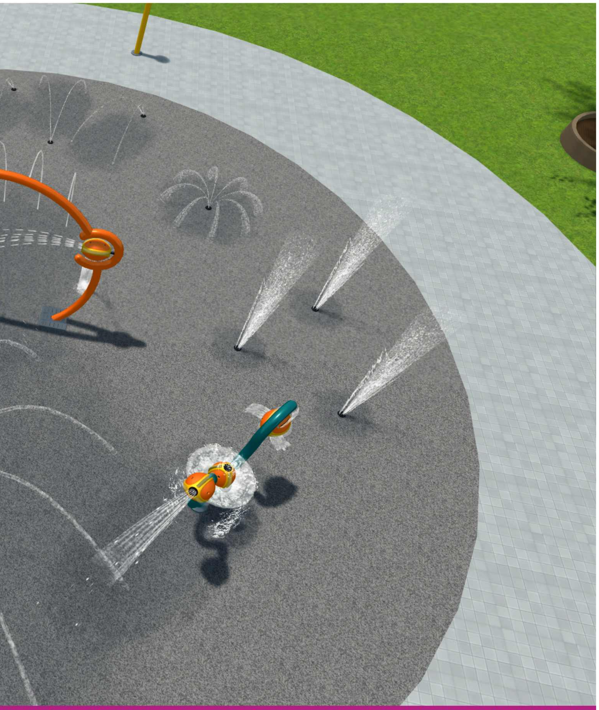
Copyright 2022 Waterplay Solutions Corp. Artist's visual interpertation of the project. Cannot be considered factual representation of the final product.