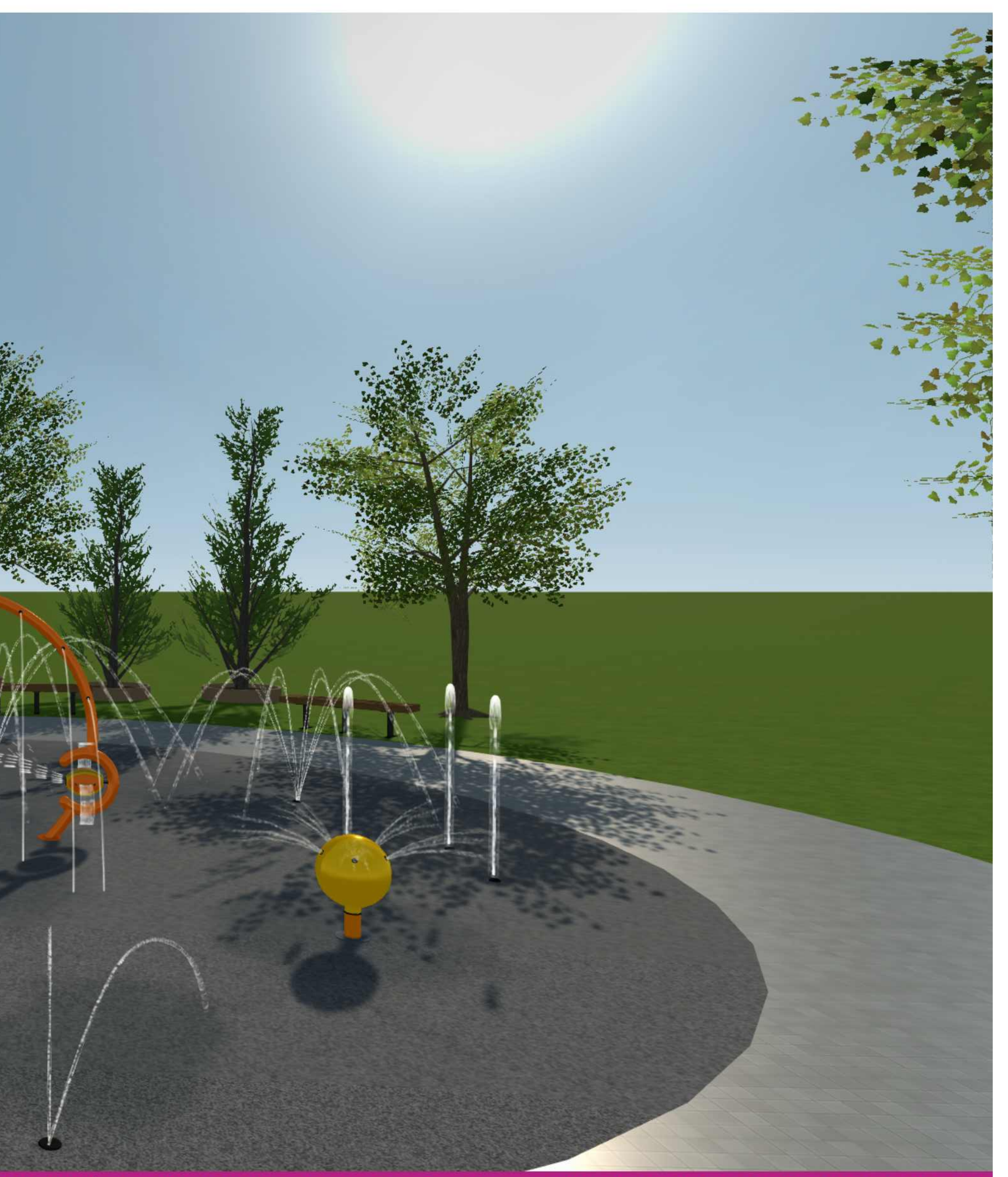
Copyright 2022 Waterplay Solutions Corp. Artist's visual interpertation of the project. Cannot be considered factual representation of the final product.