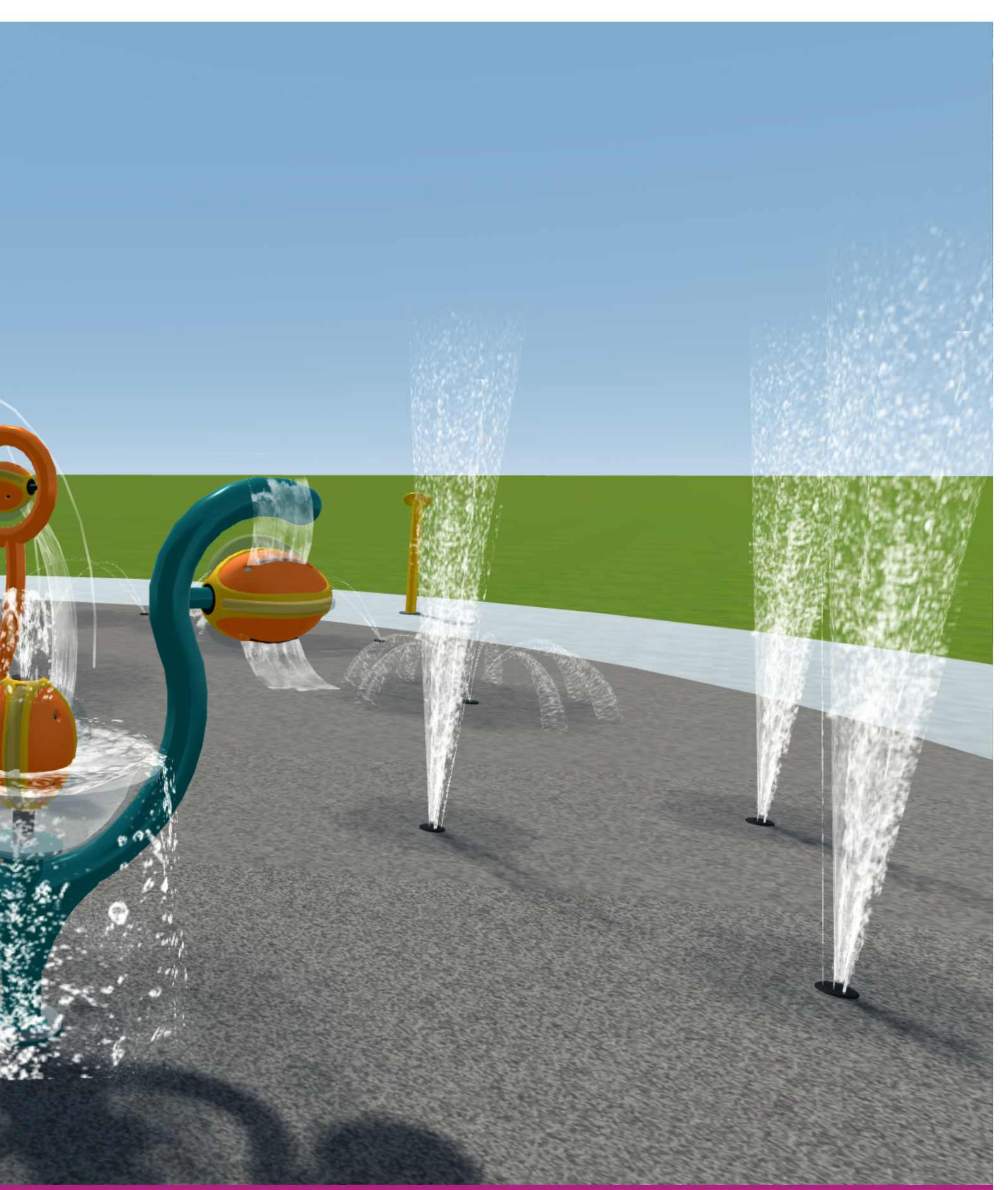
Copyright 2022 Waterplay Solutions Corp. Artist's visual interpertation of the project. Cannot be considered factual representation of the final product.