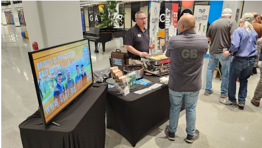
Bon Appetit Chamber event