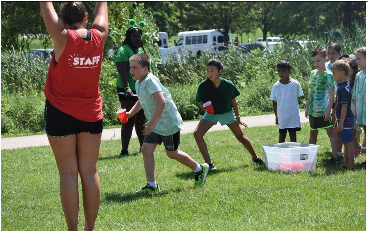
Campers enjoy outdoor games and activities during HEParks Summer Camp. Registration for the popular program begins March 20.

Hoffman Estates Park District Updated 3/14/2023 9:29 AM