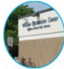
Willow Recreation Center