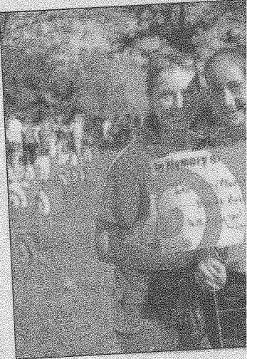
Walkers at the 2017 LUNG FOR Lung Association show off the lung disease. This year's ever

Radon Basics is a free, onehour online learning program