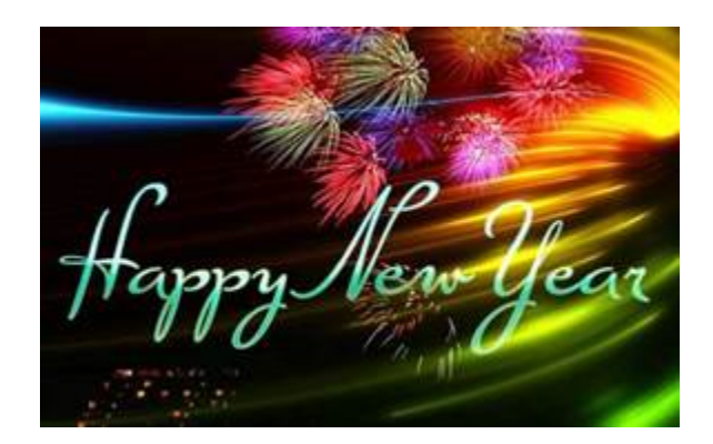
Have a happy and healthy New Year! See you in 2021!

Whenever any member of the Board of Commissioners dies, resigns, becomes under legal disability, ceases to be a legal voter in the Hoffman Estates Park District, is convicted of any infamous crime, refuses or neglects to take the oath of office after becoming elected to the Board of Commissioners of the Hoffman Estates Park District, or neglects to attend the duties of his/her office, said office may be declared vacant by the Board and may be filled by appointment by a majority of the remaining Board members. In addition, the Board of Commissioners has set a standard whereby whenever any member of the Board of Commissioners neglects to attend regular and special meetings of the Board for a period of three (3) consecutive calendar months, or neglects to attend a minimum of seven (7) regular and special meetings in any 12-month period, said office may be declared vacant by the Board.